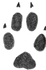
Fox paw print (5x3cm)