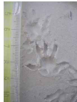
Water vole hind foot print

The female water vole occupies a territory about 70 meters of river bank and breeds after her first winter, from about March to September, having up to five litters per year. The litter consists of 2 to 9 blind and naked young which are born underground, being fully weaned at about 4 weeks. The male has a much larger territory, serving multiple females. Both male and female rarely live beyond 2 years and the average life expectancy is less than 6 months.